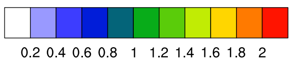
Subpolar Front index